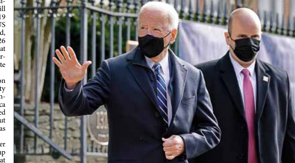
President Joe Biden waves as he departs after attending Mass at Holy Trinity Catholic Church, in the Georgetown neighborhood of Washington DC

Biden last week issued an executive order directing federal agencies to require international air travelers to quarantine upon US arrival. The order also requires that all US-bound passengers ages 2 and above for nearly USD 600 billion in get negative COVID-19 test federal spending. AGENCIES